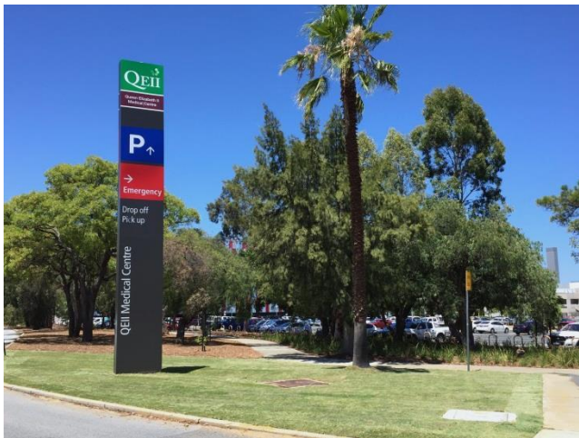
The Hospital Ave/Aberdare Rd intersection.