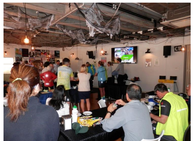
Breakfast attendees sharing ideas in the Active Transport Workshop.