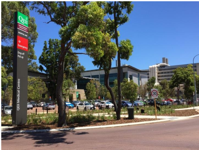
The Hospital Ave/Monash Ave intersection.

Those accessing the QEII Medical Centre via Hospital Ave from either Monash Ave or Aberdare Rd are now greeted by thriving and carefully mulched native plants including kangaroo paws and grass trees. Sections of new turf have also been rolled out along Aberdare Rd, while the removal of some struggling trees and unruly scrub has brightened the northern end of Visitor Car Park 1 and will give existing trees and the new plants an opportunity to flourish.